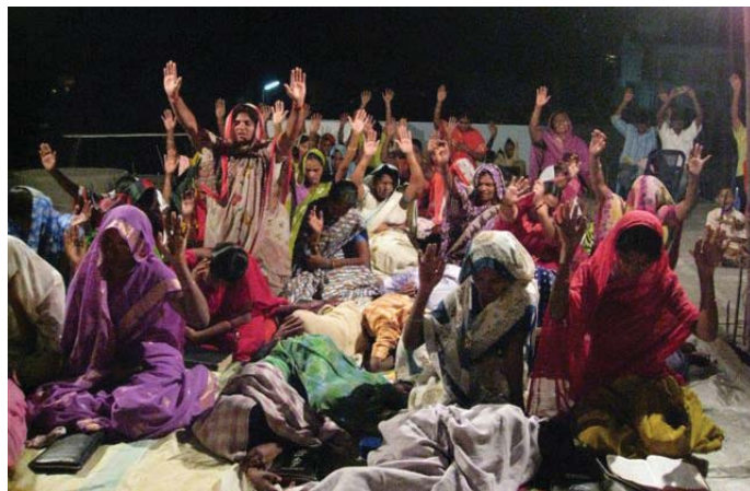
Photo: Souls standing and lifting hands in response to the invitation to receive Christ at the roof top meeting in Peduguralla

This young man and his wife are so totally dedicated to this new work. I was so deeply touched and amazed. They have been able to purchase the land and build the foundation and floor for the new church building by their personal sacrifice and hard work.